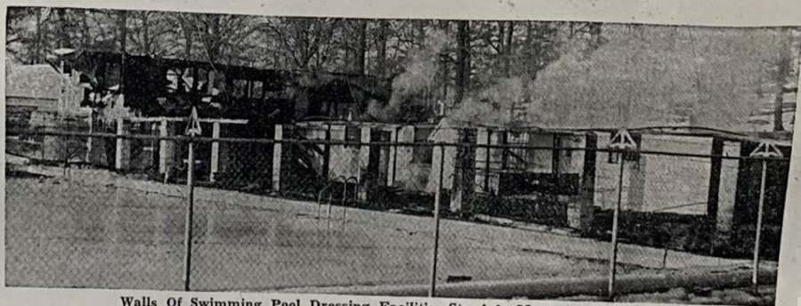
Walls Of Swimming Pool Dressing Facilities Stand As Memorial To The Past