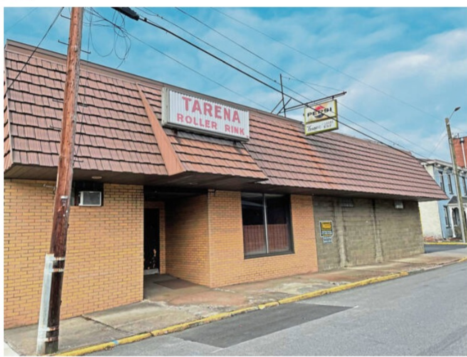
The Tarena Roller Rink in Tarentum