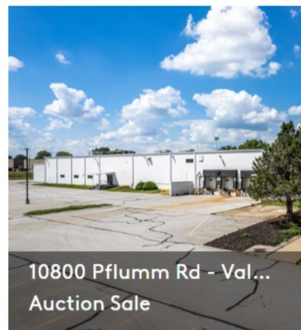
10800 Pflumm Rd - Val... Auction Sale

Listing ID: 26477838 Date Created: 8/24/2022 Last Updated: 9/1/2022 Address: 6220 Kansas Ave, Kansas City, KS