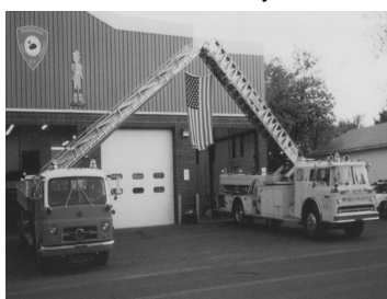
Ravena Hose Co. #1, Main St. 1988