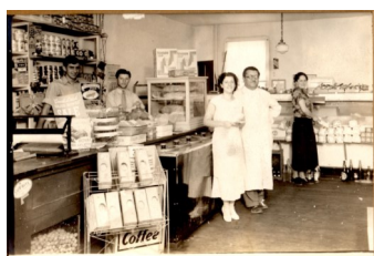
Chicorelli's Market, Main St. 1931