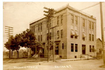
Masonic Temple, Main St. 1905