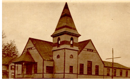
Ravena Christian Church, corner of Main St. and Mountain Rd. 1890