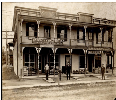
Roberts Building, with Babcock & Baldwin Furniture and Undertaking, corner of Main St. and Pulver Ave., circa 1894