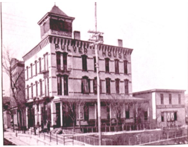
Pulver House , corner of Main St. and Railroad Ave. 1884