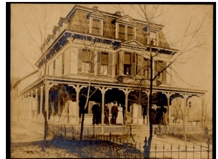
Temperance House, corner of Central Ave. and Main St. 1892