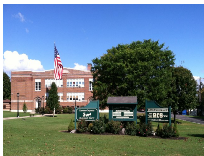
Village Municipal Offices, Mountain Rd. in 2014