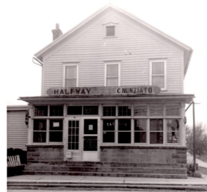
Halfway House Tavern, Main St. 1914