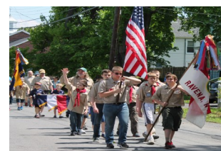
Centennial Parade 2014