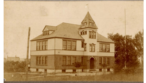
Ravena School, Mountain Rd. 1889