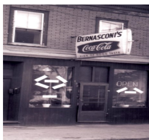
Bernasconi's Pizza, Main St. 1967