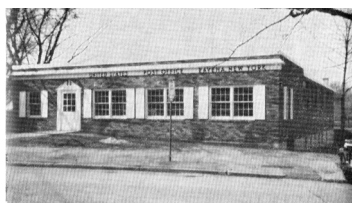
Ravena Post Office, Main St. 1963