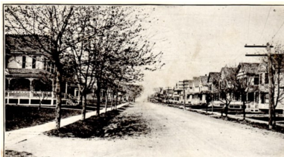
Pulver Avenue circa 1906