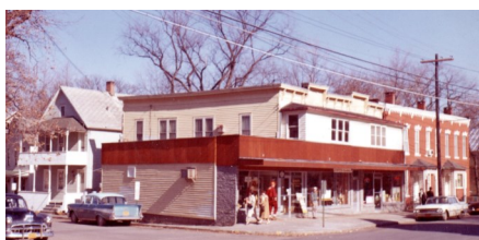
Bush's News Room, Main Street 1945