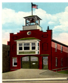
Ravena Fire Department, Main St. 1913