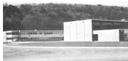
RCS Junior-Senior High School. Rt. 9W 1963