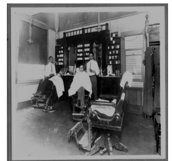
Munzberg's Barber Shop, Main St. 1914