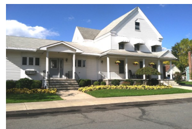
Babcock Funeral Home, Pulver Ave. 1929