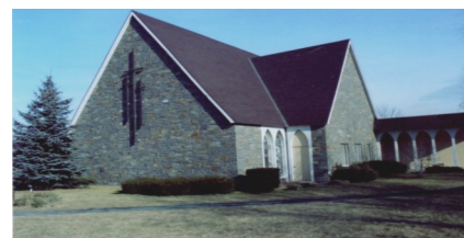
Grace United Methodist Church, Hillcrest Dr. 1965