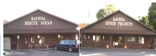
Ravena Rescue Squad/Senior Projects 1991