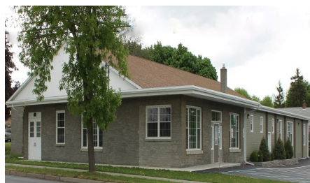
RCS Community Library, Main St. 2013