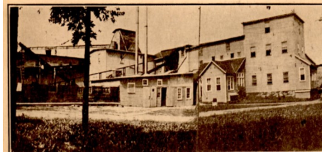
Albany County Produce Co./Duffy Mott, Dempster St. circa 1880s