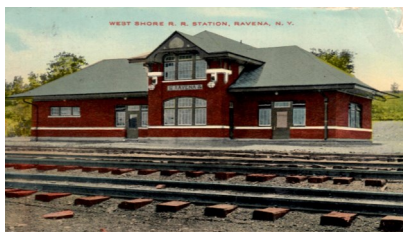
West Shore Railroad Ravena Station, Russell Ave. 1911