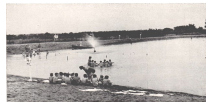
Moshers Park Swimming Pool 1936