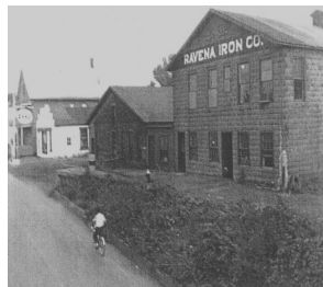
Ravena Iron Co., Main St. 1902