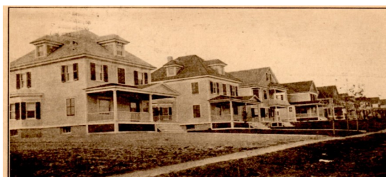
McCulloch Avenue circa 1925