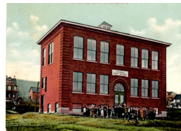
Ravena H.S., Mountain Rd. 1910