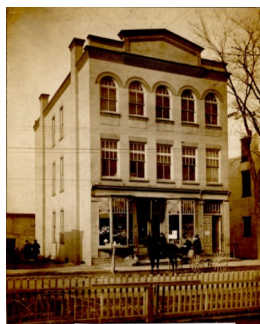
Odd Fellows Temple, Main St., Hartt Grocery and Ravena Post Office, 1906