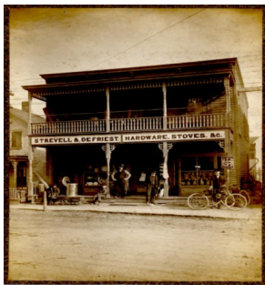
Strevell & DeFriest Hardware Store, corner of Main St. and Central Ave. 1889