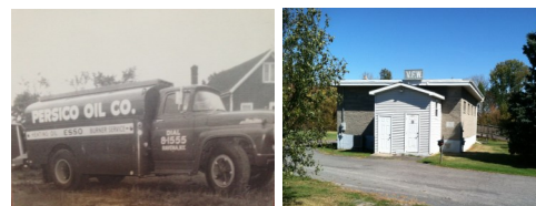
Persico Oil Company 1948 V.F.W. Building 1955