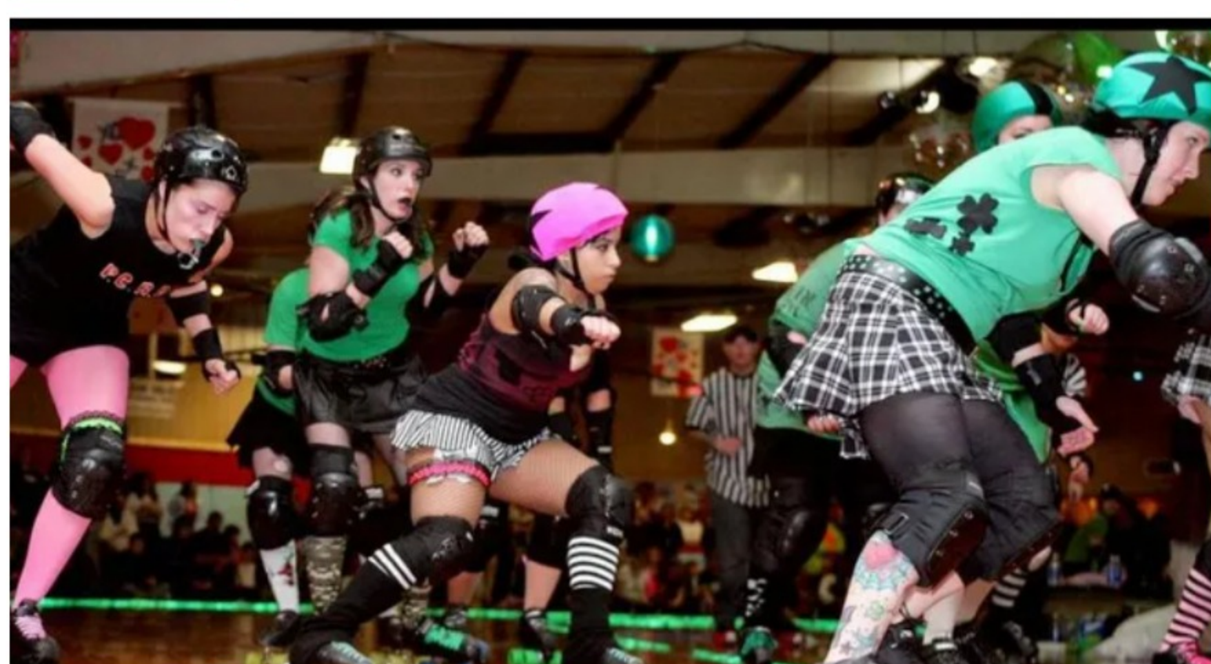
The county's last skating rink is now closed. The News Herald

View Comments [Facebook] [Twitter] [Email] [Share]